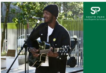
SOUNDS OF SOUTH PARK SERGIO SNOW 6-8 PM, FRIDAY, AUGUST 27 SOUTH PARK COMMONS 1120 S GRAND